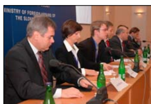
Morning Session at the Ministry of Foreign Affairs of The Slovak Republic