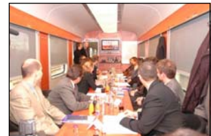
Video conference with NATO Secretary General Jaap de Hoop Scheffer