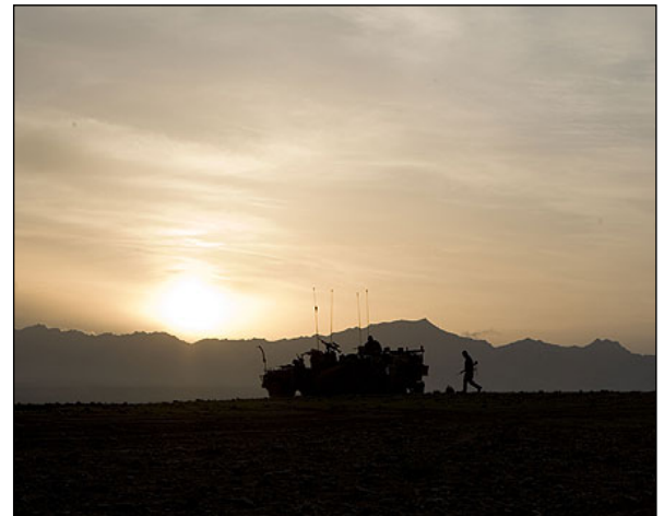
NATO's photo of the week: Sunset over Afghanistan